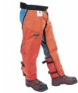
Labonneville Full-wrap Chainsaw Chaps $107-$122