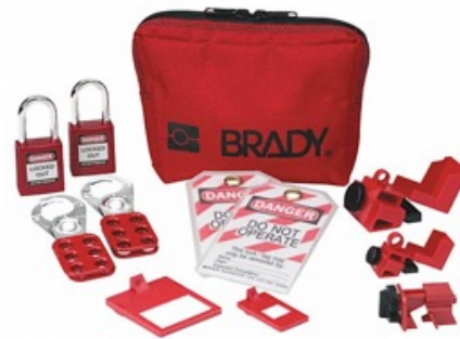
Portable Lockout Kit, Electrical Filled Electrical $131.65