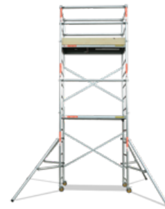
Mini Mobile Scaffold-Aluminum SKU210002