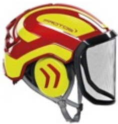
Pfanner Protos Helmet $309

HELMETS – consider low profile hearing protection so avoid snags. Consider overhead hazards such as electrical to choose the right Helmet.