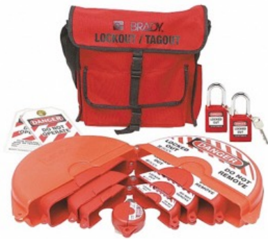
Portable Lockout Kit , Filled Valve Lockout $387.03

Lock out/Tag out Stations-filled and unfilled for General use, Valves, and Electrical; Individual pieces for Lock out/Tag out, Tags, and Locks, Arborist safety equipment (Elvex chaps-calf wrap style, Elvex Loggers helmet with low profile hearing protection and face shield); Eyewash stations; Flammable cabinets;