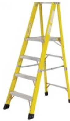
5' Fiberglass Platform Ladder FL300P (Price TBD)