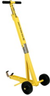
Jungle Jack by Jungle Jim $215-$290