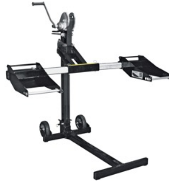
MoJack PRO $430-$550