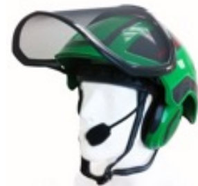
SENA Integrated Comm. System $220-$250 Helmet is separate.

CHAPS – review any pair of chaps for specs. Ensure the chaps will fit your employees.