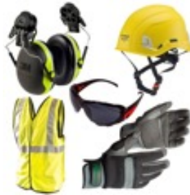
TreeU New Hire Premium Kit $149.99. Chaps sold separately.