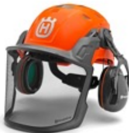
Husqvarna Tech Forest Helmet $130