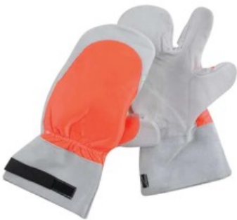
Swedepro Chainsaw Mitts (L) $51.43