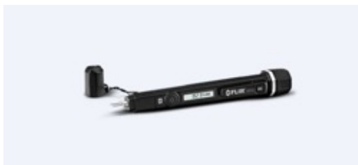
Moisture pen and flashlight

Types of inspections https://monroeinfrared.com/infrared-inspections/