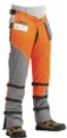
Husquavarna Technical Apron Chaps-$109.99

CHAPS – review any pair of chaps for specs. Ensure the chaps will fit your employees.