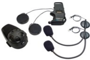
SENA SMH-10 Bluetooth Comm. System $256.99