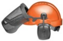
Elvex ProGuard Chainsaw Safety Helmet Kit NRR 25 dB $48.50