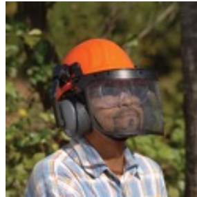
ERB Chainsaw Safety Helmet Kit NRR-28 dB $56.65