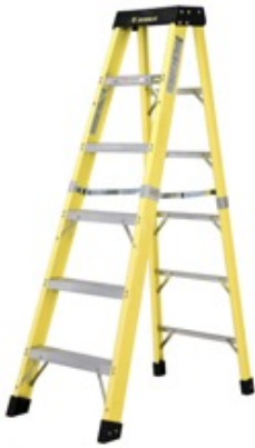
5' Fiberglass Step Ladder FL 300 (Price TBD)

(Stock limited. Call for accurate pricing.)