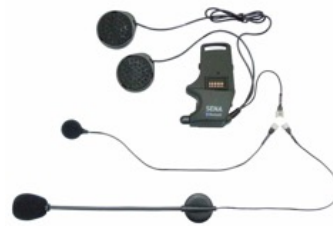
SENA Communication Spare Parts Kit $52.99