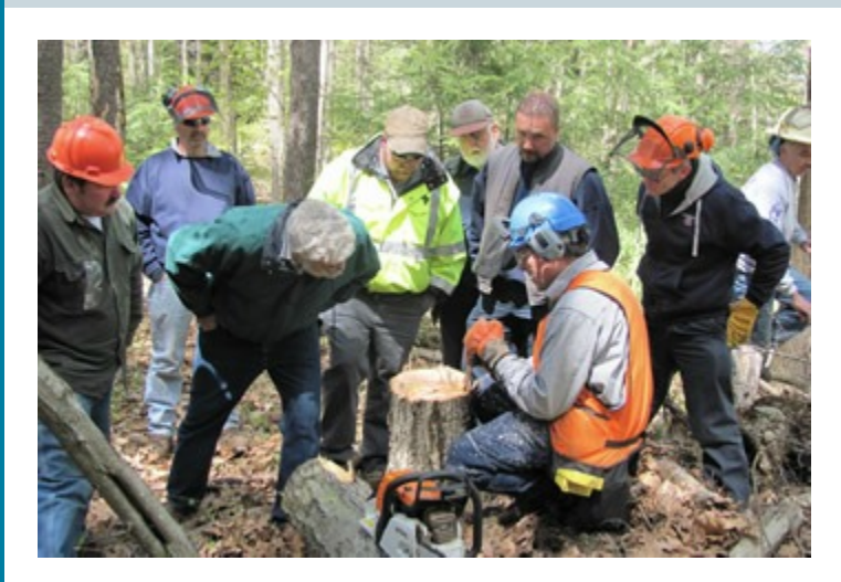
MIIA would like to invite you to attend a one-day training on